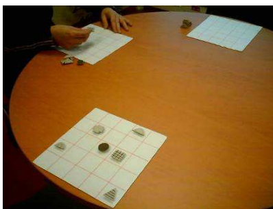
Figure 1. Reference task illustration.

4.1.1 Situation. Three square metal sheets are placed at three different points, 90° rotated around the table. The sheets are twenty-five centimetres wide. We use six magnetic pieces of various geometric shapes such as a triangle, a cross, a trapezium, a disk, a half-disk and a square. Each piece is covered with different textures: soft, rough, wire netting, cardboard, tactile lines and crossed tactile lines. All this aims at helping the subject to distinguish all these different objects from each other. The pieces are placed only on the first sheet; on the other two they are placed next to them. A non-tactile gridline is drawn on this handling space. Each magnetic piece is placed in the middle of a five centimetre non-tactile square. The grid lines allow us to measure errors when the blind subject reproduces the layout ( cf. figure 1).